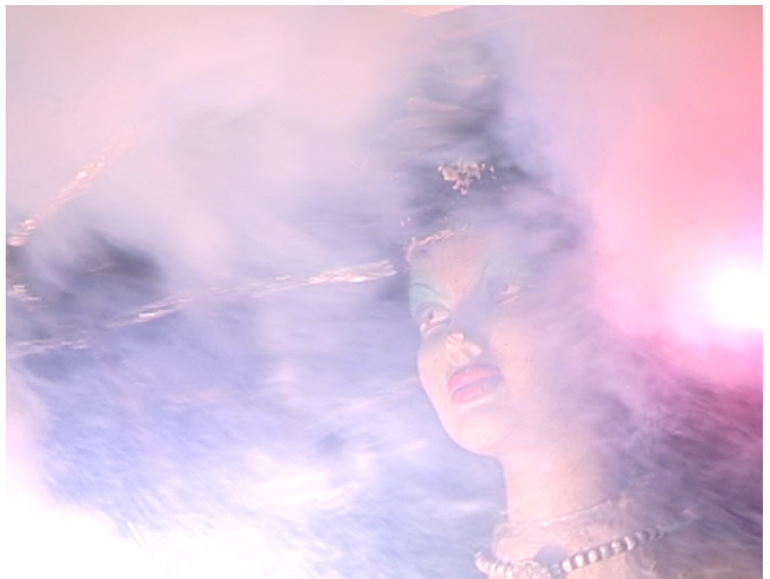
Ingeborg Lüscher, La Pupa Proibita , 2006, capture vidéo. © Ingeborg Lüscher / videoart.ch