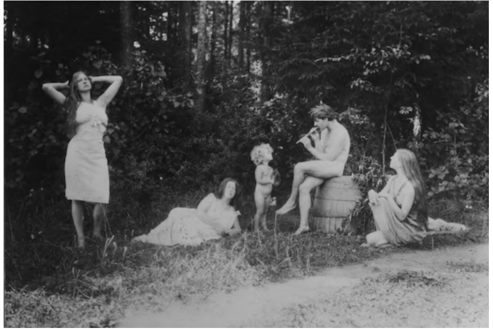
Photographie des invité·e·x·s du sanatorium.