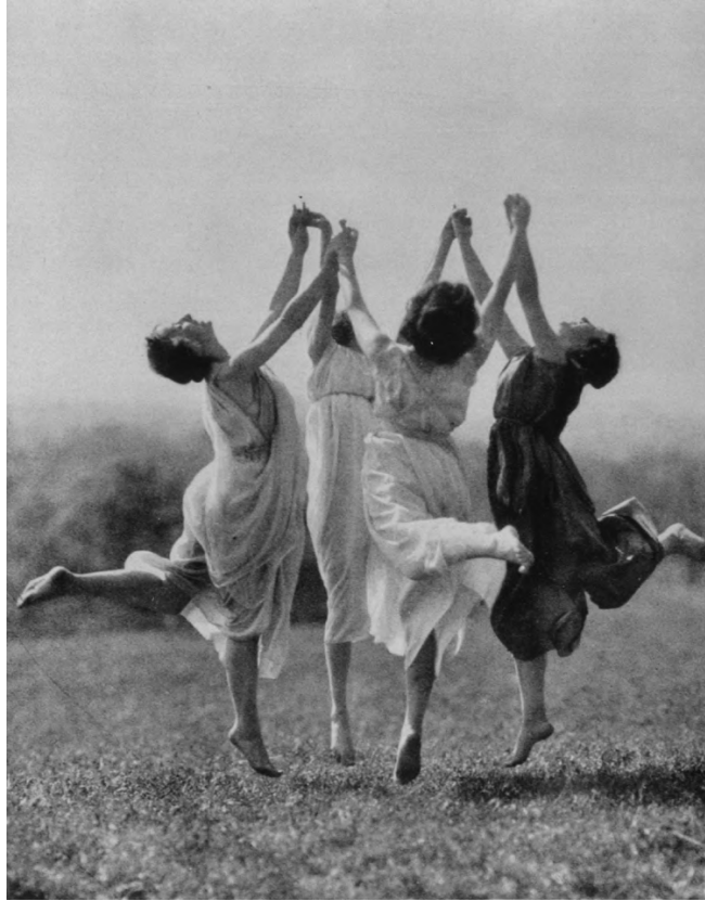
Groupe de danseuses à Monte Verità.

Publication in March 2024 of the book Les voix magnétiques ( The magnetic voices ) about the female figures who lived at Monte Verità and a collection of images, edited by Federica Chiocchetti and Nicoletta Mongini.