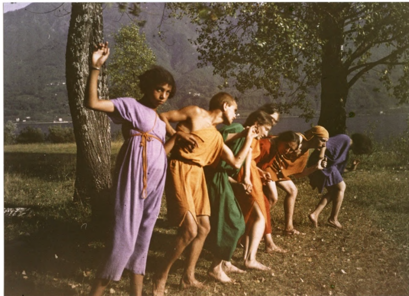
Group photography with Mary Wigman.