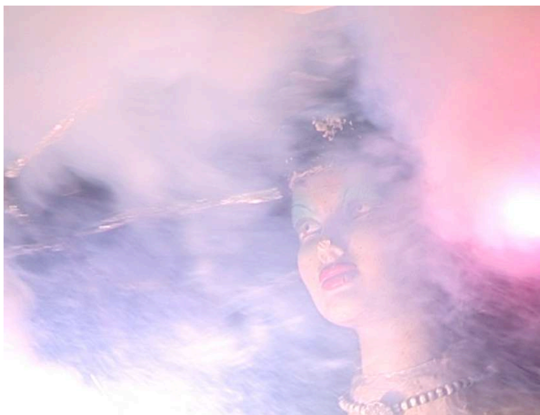
Ingeborg Lüscher, La Pupa Proibita , 2006. Video. Screen shot.