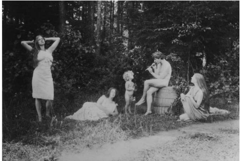
Photography of sanatorium guests.