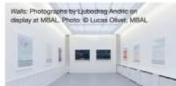
Walls: Photographs by Ljubodrag Andric on display at MBAL.

Current exhibitions include display artists such as Sol LeWitt, Anni Albers, or