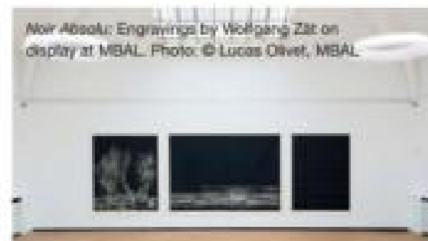
Moir Absolu: Engravings by Wolfgang Zitt on display at MBAL.

Ljubodrag Andric. With upcoming exhibitions dedicated to photography in summer as well as a survey show of the print work by Georg Baselitz in fall, a visit to the Canton of Neuchâtel and the Musée des Beaux-Arts within the next months is particularly enticing.